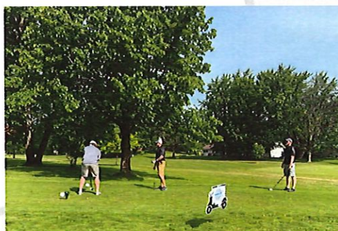
18th Annual Golf Classic Fundraiser.