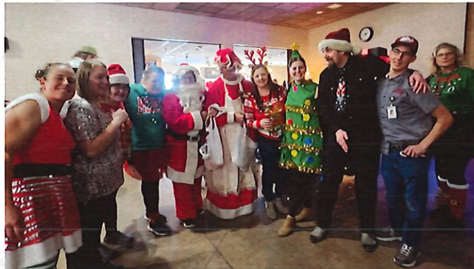
BRI's annual Christmas Party is always a BRI favorite.