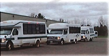
stration (FTA) as authorized under 48 nity donations help us to purchase our